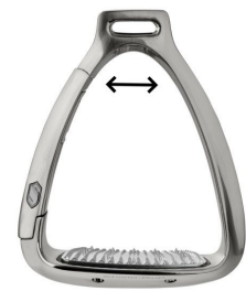
Example of a stirrup with a narrow arch.

6) Bad Luck. No stirrup can 100% guarantee that you will not be caught during a fall.